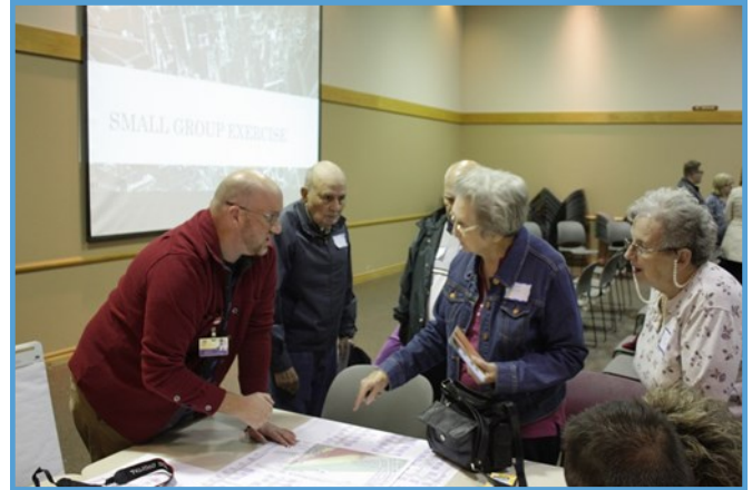
Figure 2: Participants discuss ideas to improve their neighborhoods at the Visioning meeting.

The IRIP process has also included public input and outreach. A visioning meeting was held in mid-October at the Moore Public Library. Residents in attendance were asked to envision ways to better rebuild, and to incorporate innovative approaches to things such as traffic calming and stormwater management. A couple of public workshops were also recently held to assess the walkability of areas surrounding Plaza Towers elementary and Highlands East Junior High. At these workshops team members met with the public and explained what walkability is, why it is important, what contributes to making a space walkable (or not), and led them through the process of completing a 'Walkability Checklist' for their neighborhood. Participants left the meetings with copies of the Checklists to pass out to neighbors and complete on their own for routes they routinely walk in their neighborhoods.